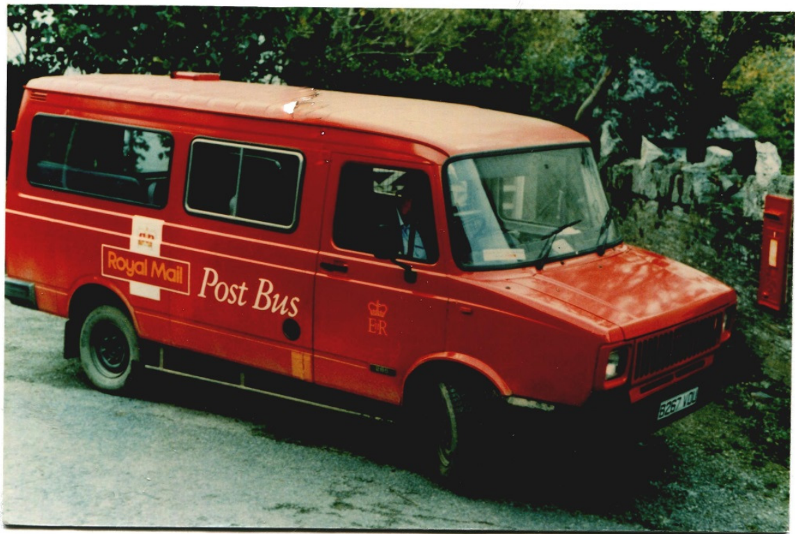
Royal Mail Postcard of a Post Bus – 1995 era