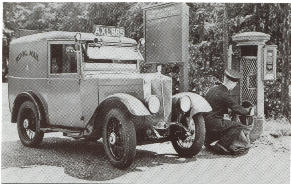
A Morris Minor van at Rickmansworth (1934)