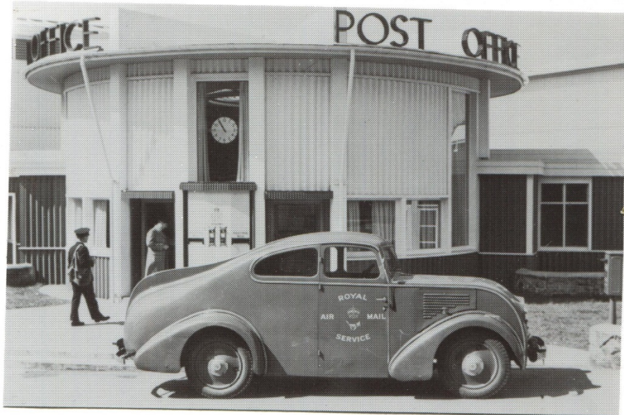
A Morris 'C' type with streamlined body to publicise the Air Mail service