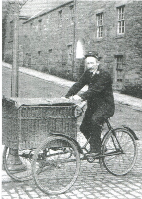
A Post Office Tricycle (circa 1920)