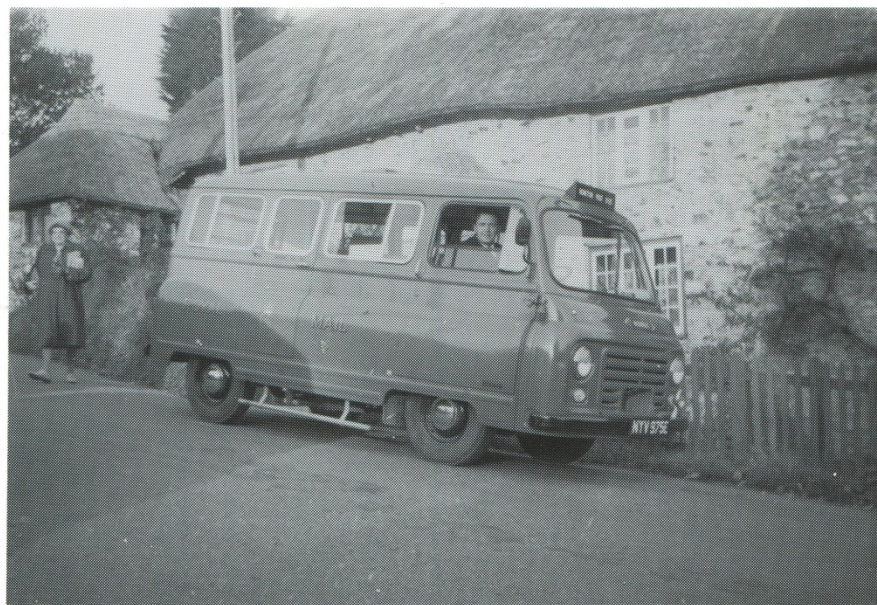
A Morris 'J2' 7-seater Postbus near Honiton in 1967