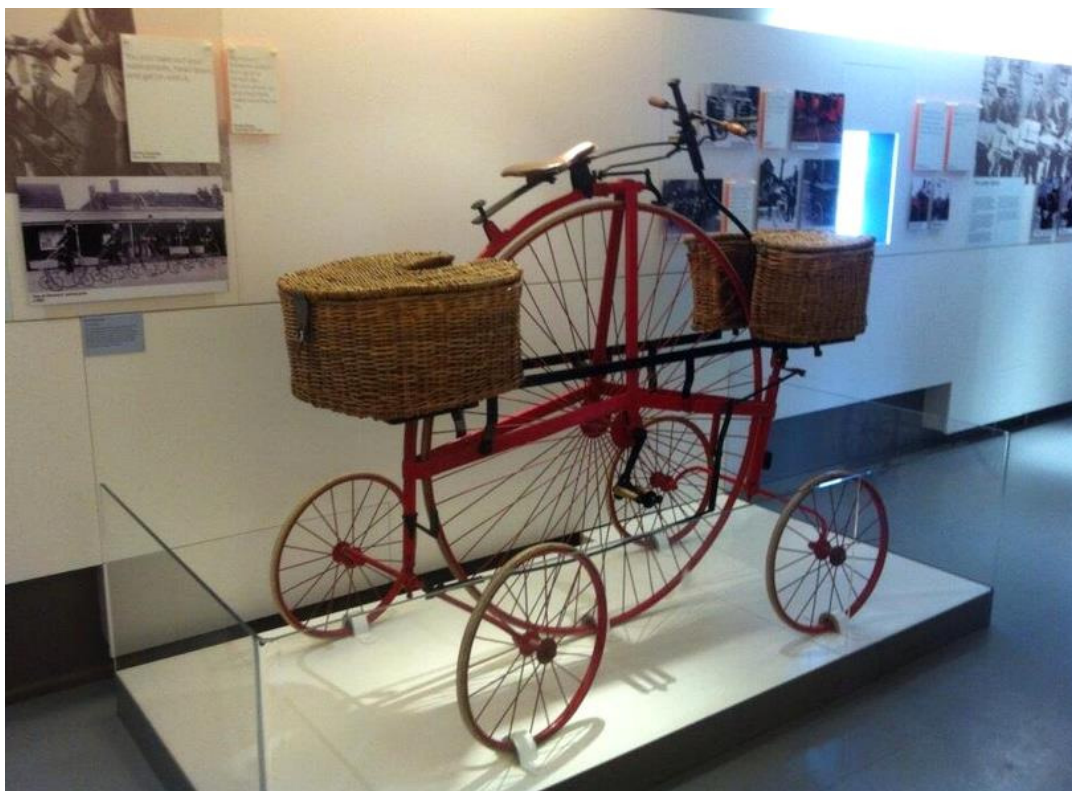
19 th Century Post Office “Penny-four-farthings”