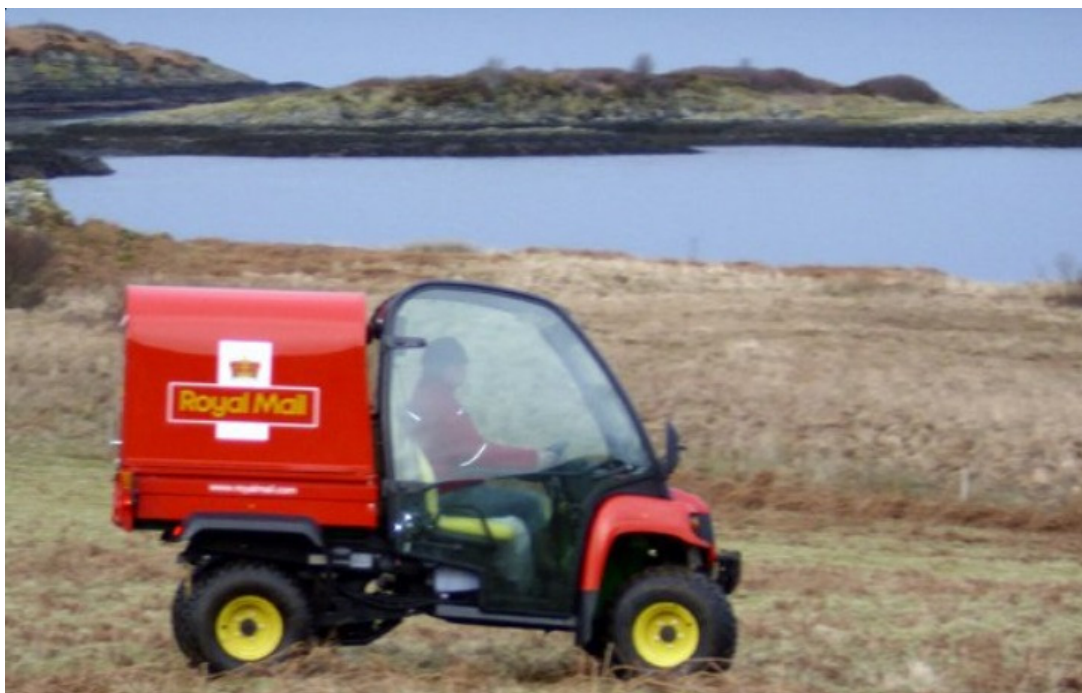
Royal Mail “Quad-cart”